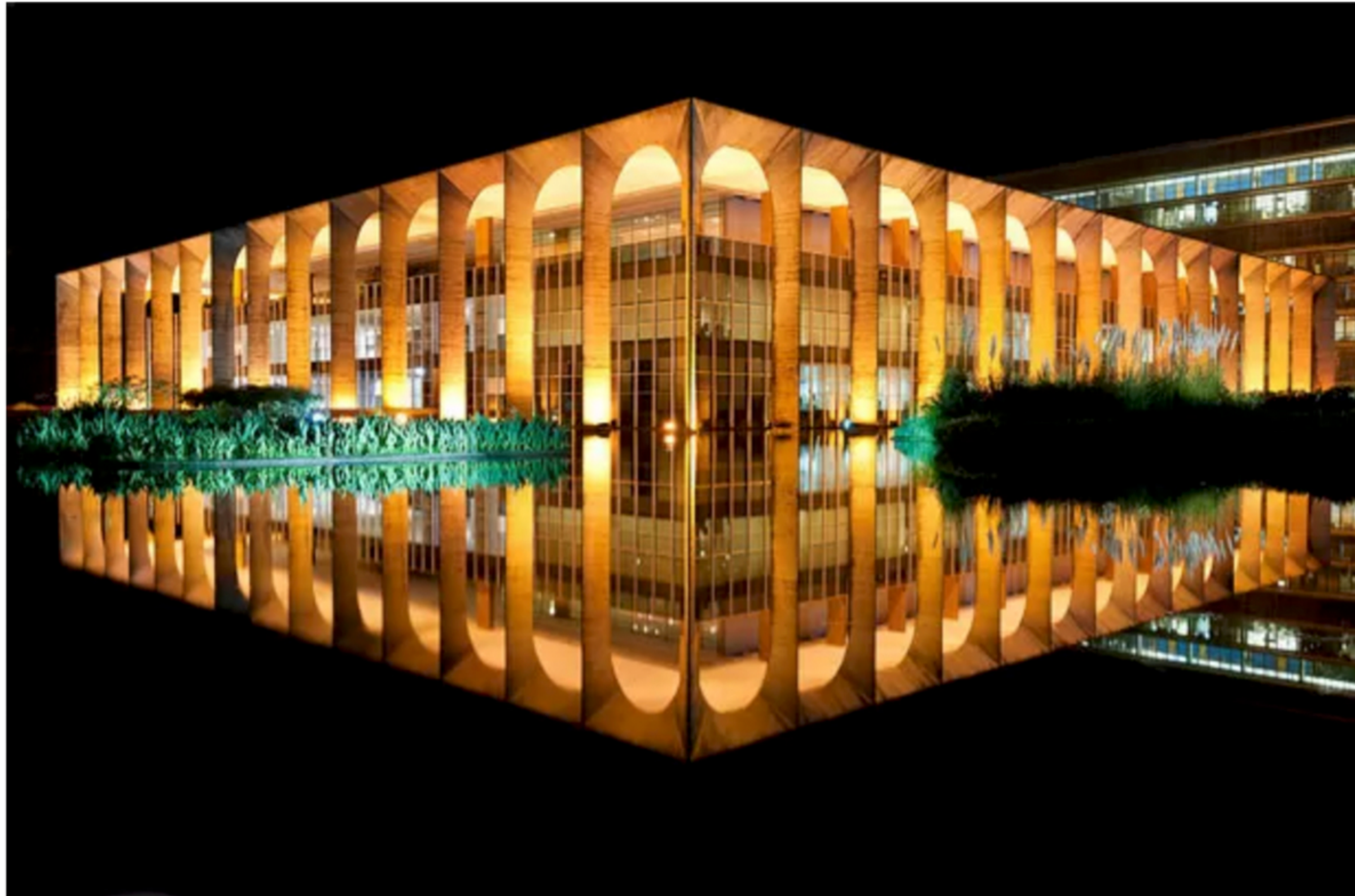
Itamaraty Palace , 2012

09 NOV 2013 - 6:00 AM | UPDATED 09 NOV 2013 - 6:00 AM