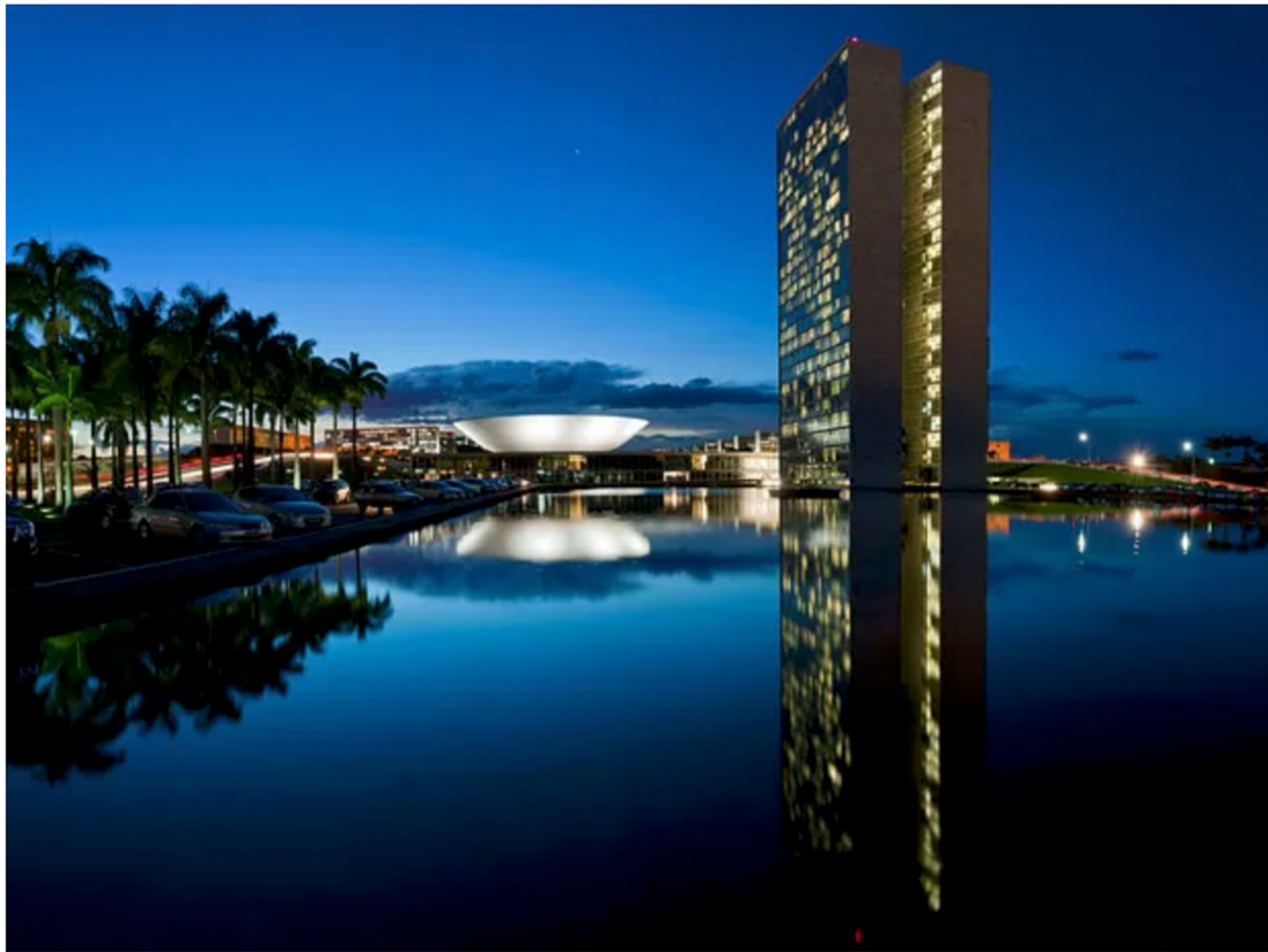
National Congress , 2012