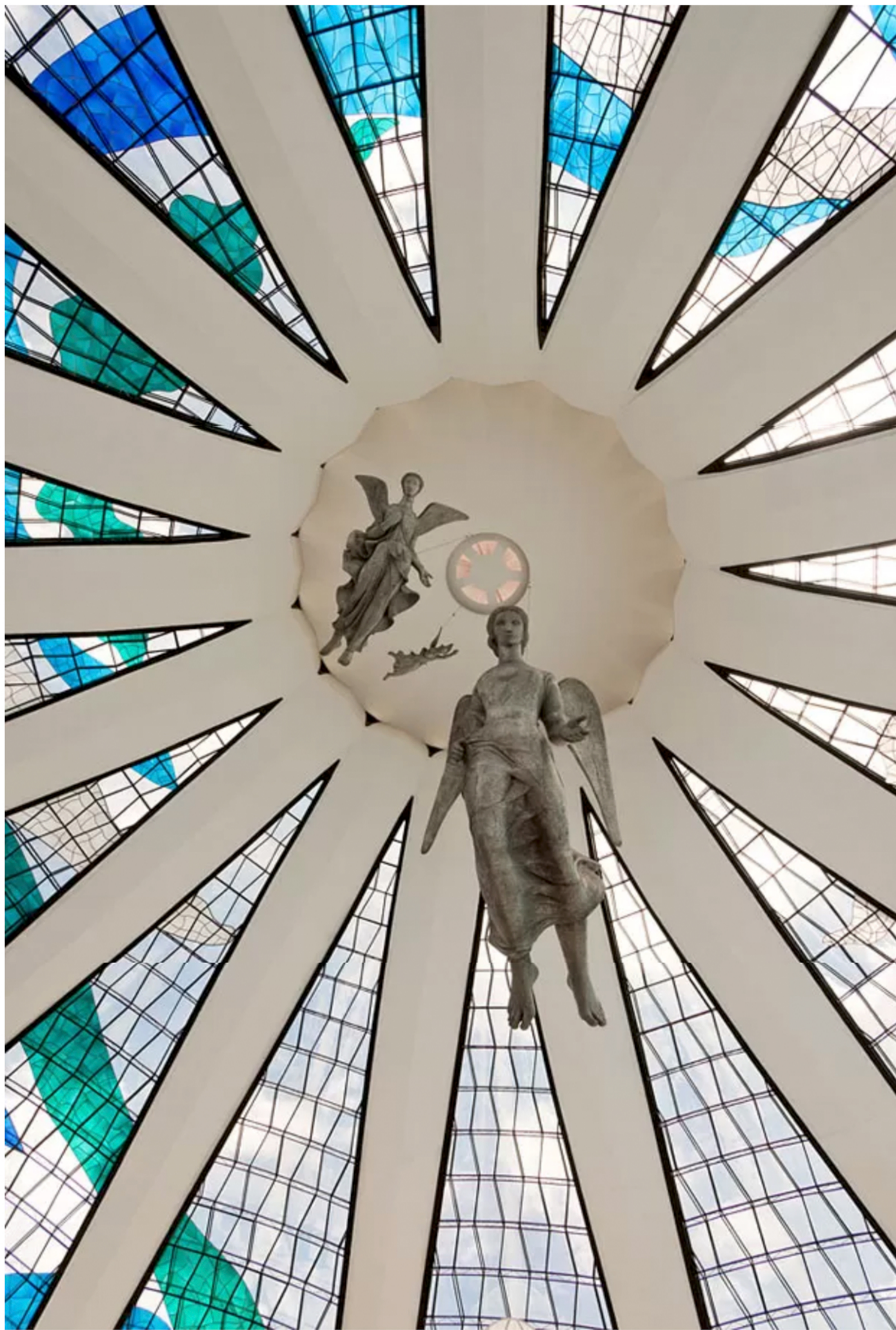
Brasilia Cathedral , 2012