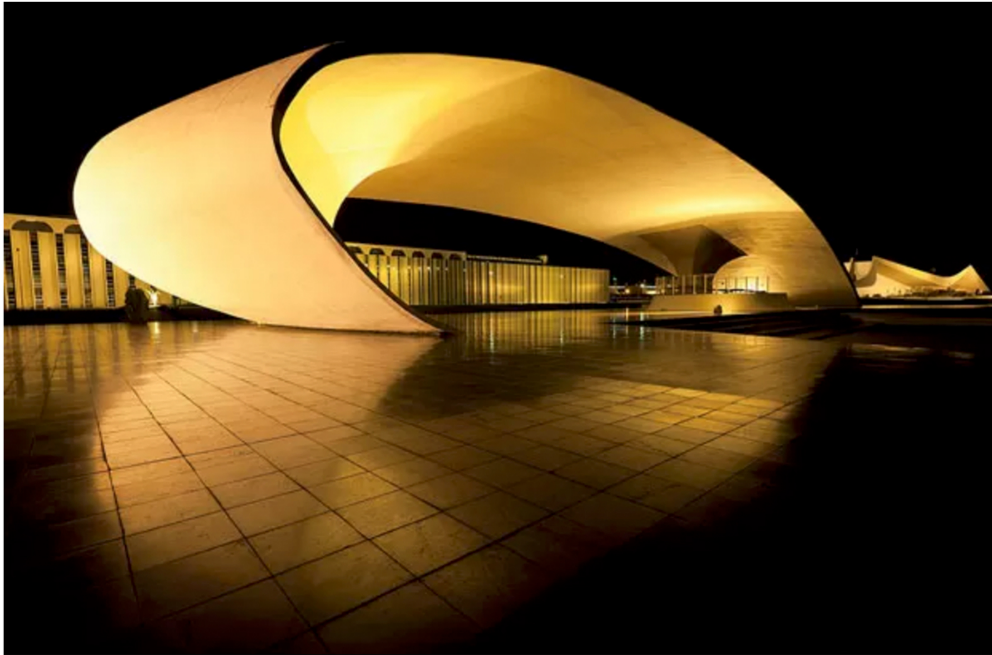
Duque de Caxias Square , 2012