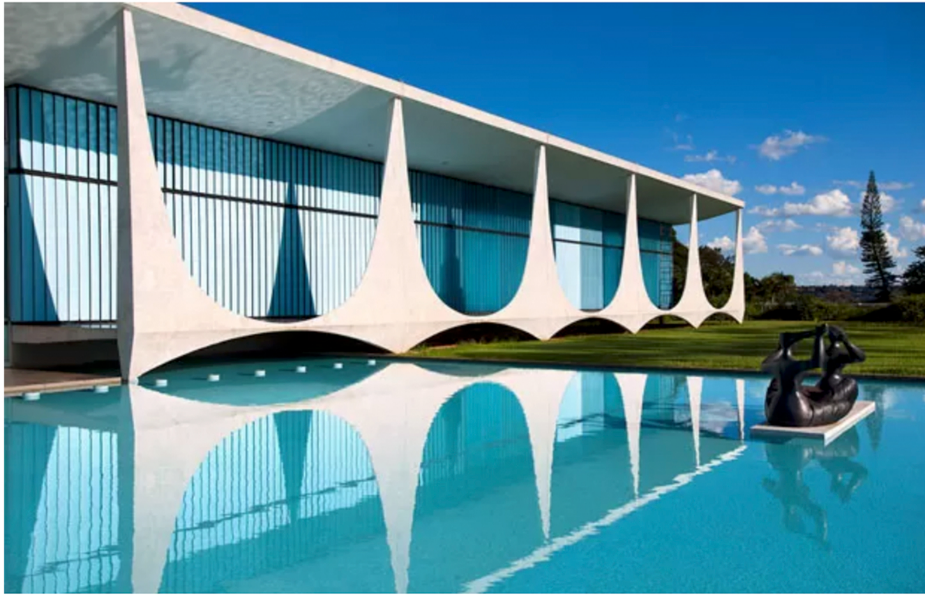
Alvorada Palace , 2012