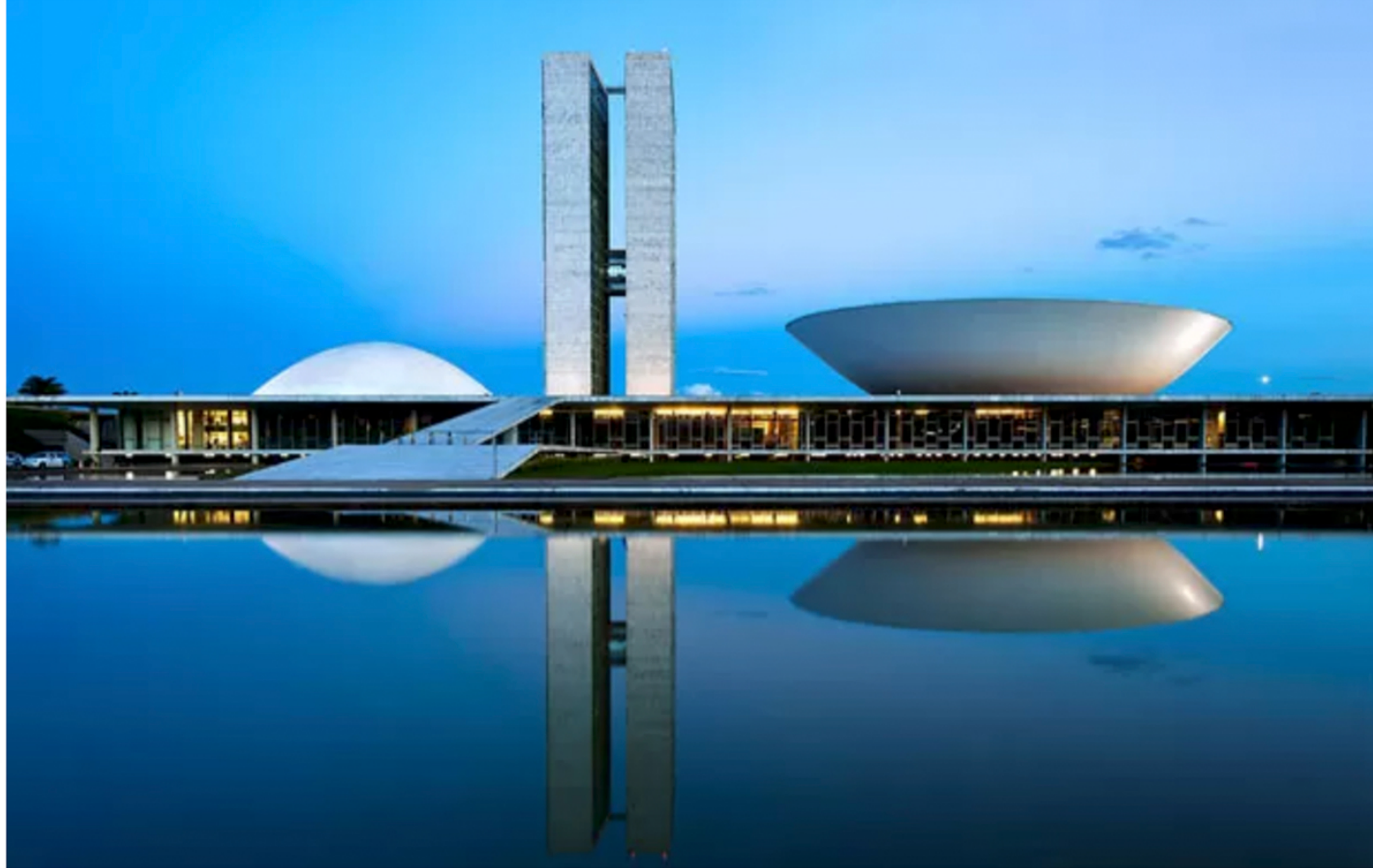
National Congress , 2012