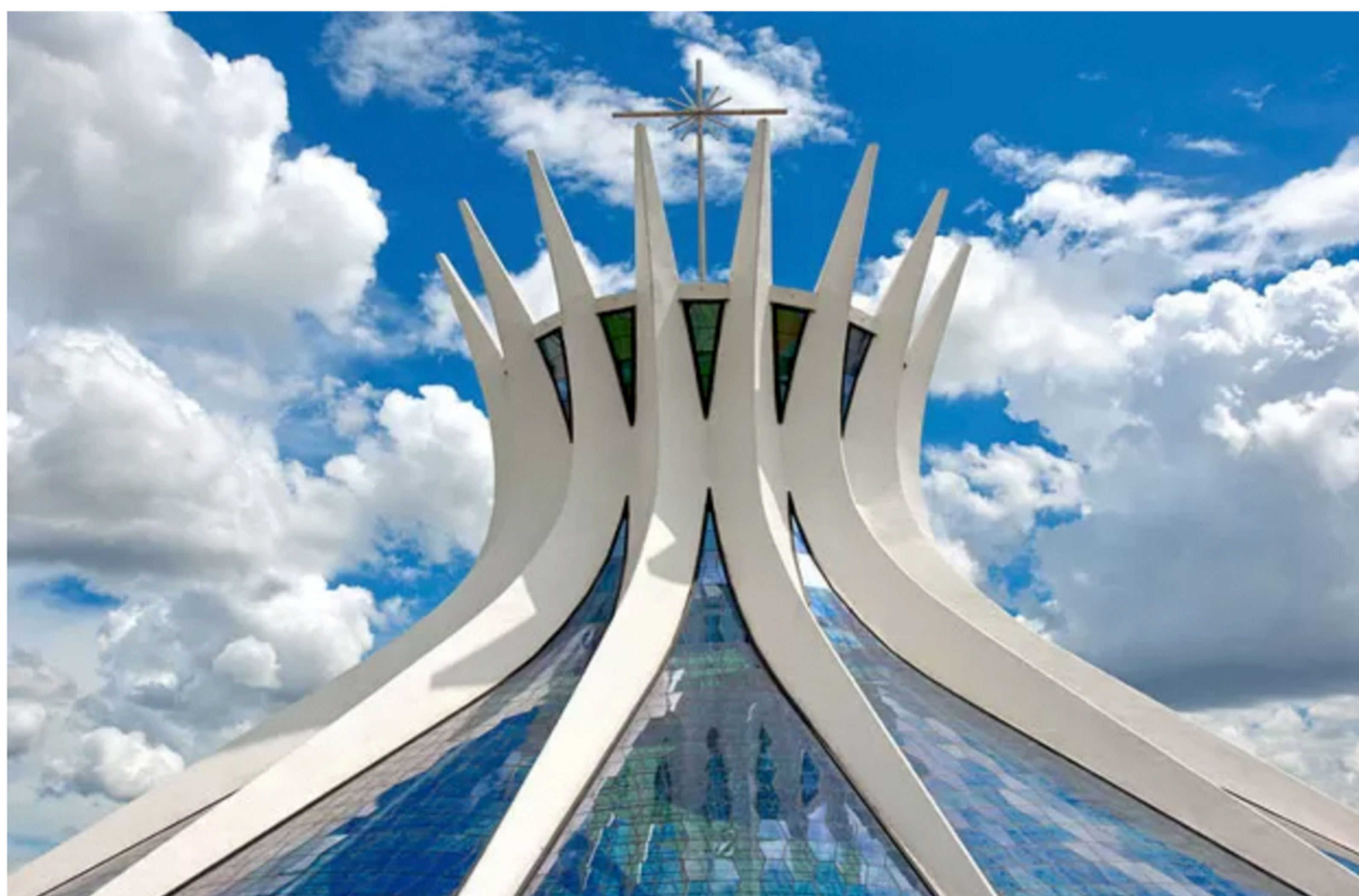
Brasilia Cathedral , 2012