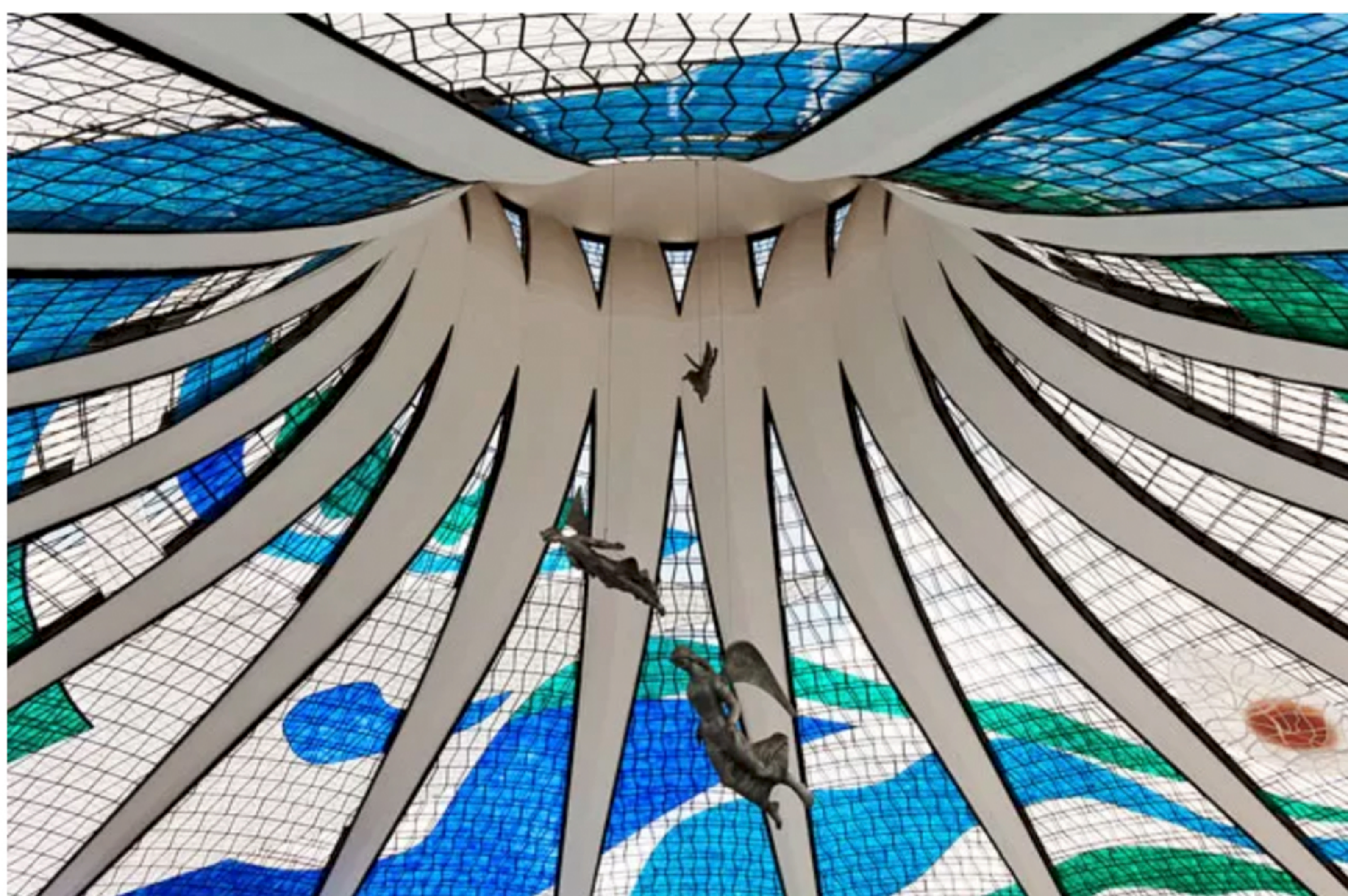
Brasilia Cathedral , 2012