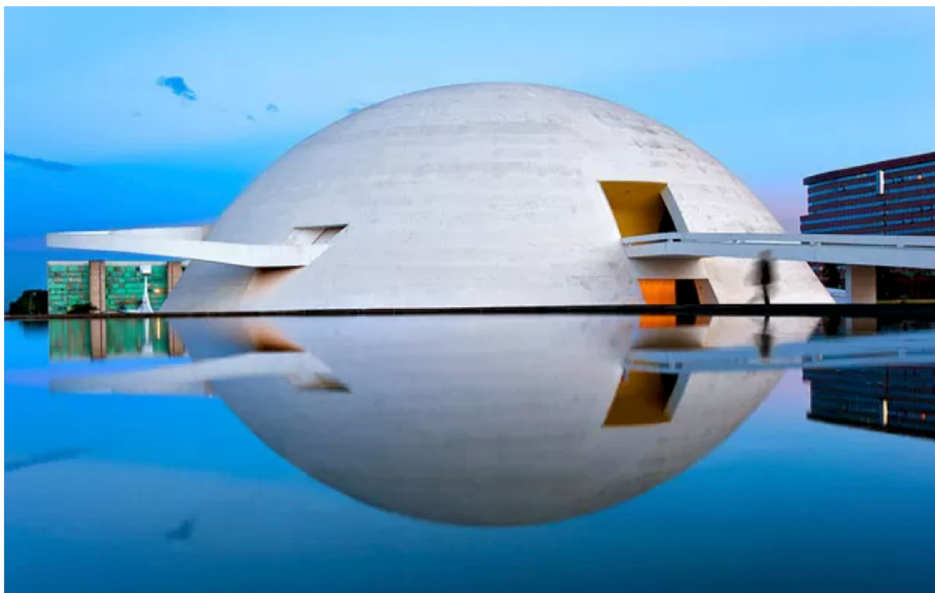
National Museum of the Cultural Complex of the Republic , 2012