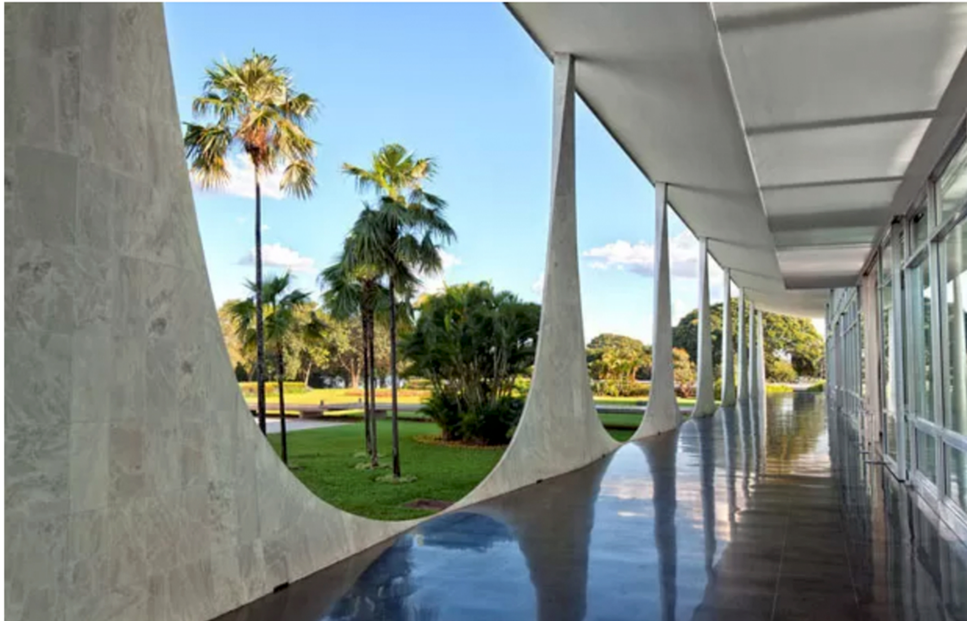
Alvorada Palace , 2012

“Brasília remembers the place where I grew up, Florida, due to the existence of a lot of open space, the lifestyle more suburban than urban and the slower pace than in other capitals”, said the photographer. “In addition, there are plenty of green areas, sun, swimming pools and blue skies”, he added. “Even if the city is criticized for its utopian character, it seems to me that Niemeyer and Lucio Costa got it right in several urban aspects, especially far from the Monumental Axis, in residential areas”, he analyzed.