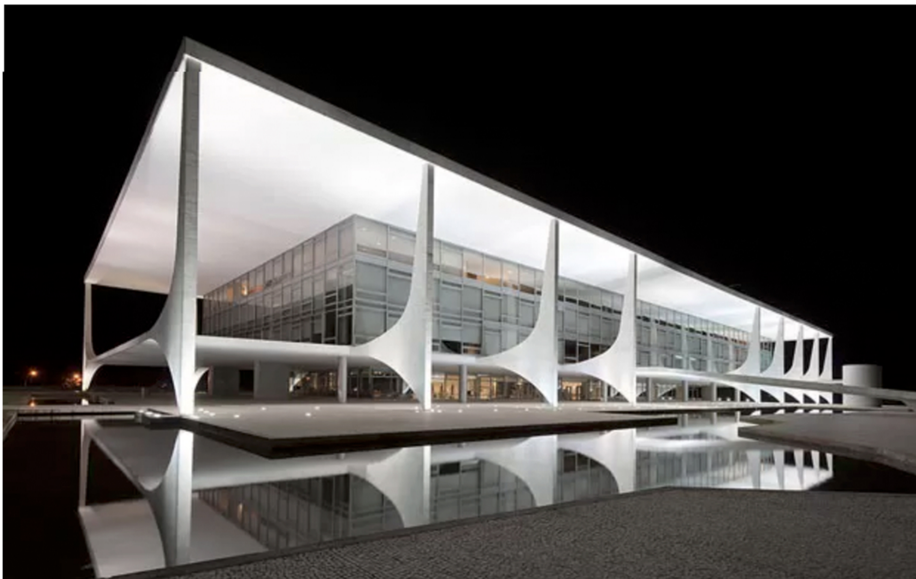
Planalto Palace , 2012